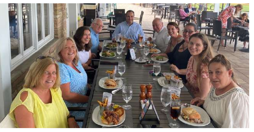
Our amazing team enjoying a staff appreciation lunch at Hollywood Golf Club